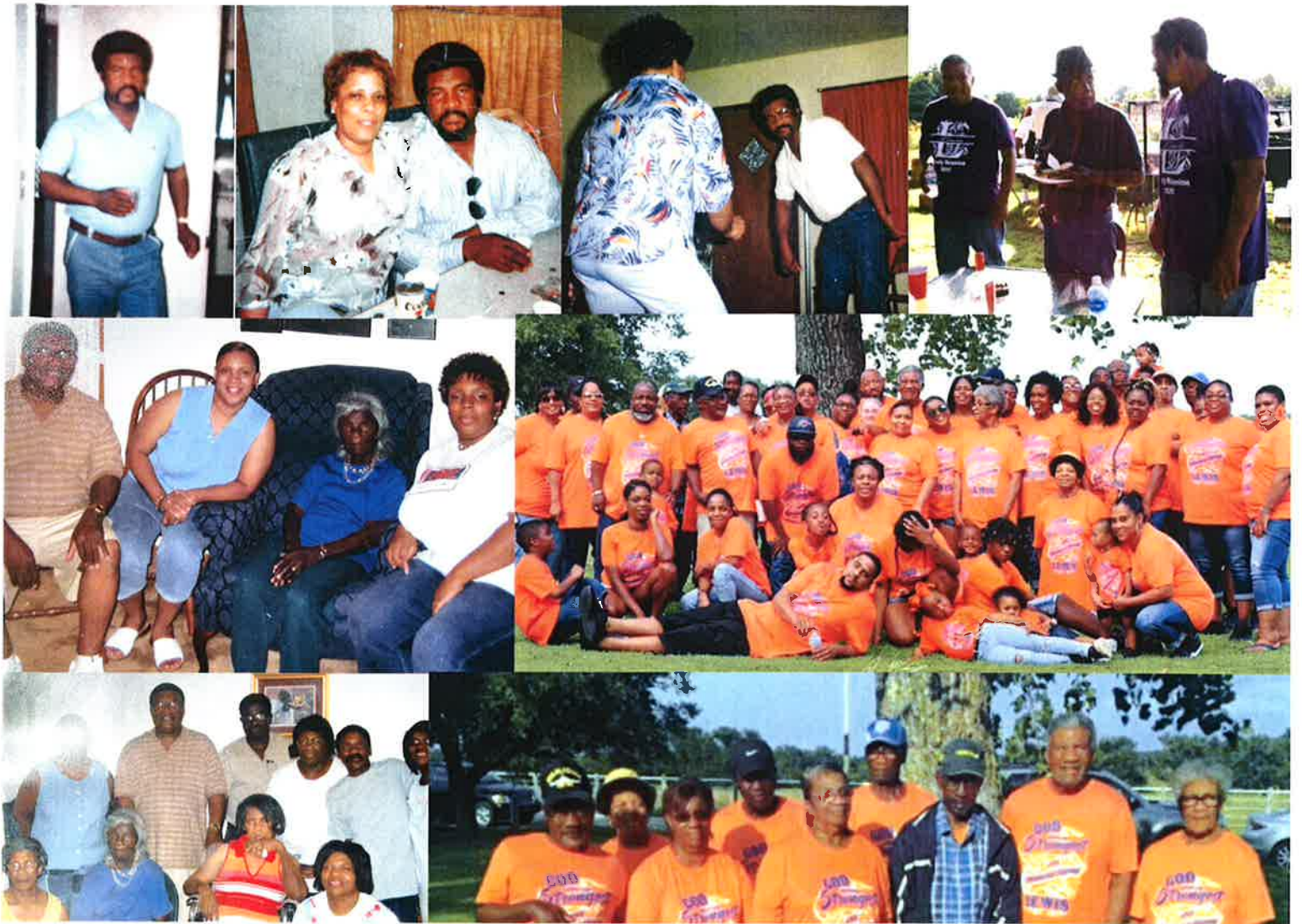
DIAMOND PRINTING & PUBLISHING, INC. ◊ OKC, OK